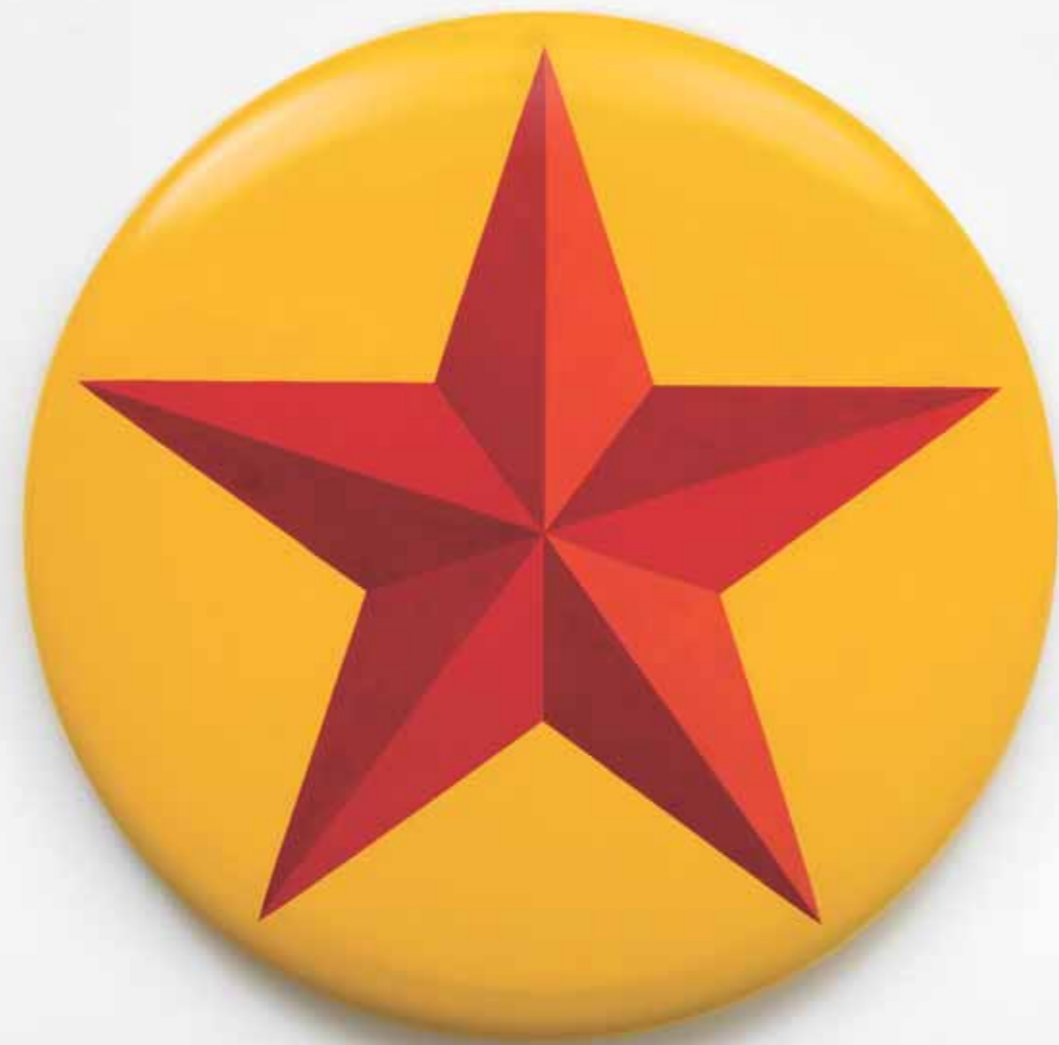
Red Star 2020 Synthetic polymer on aluminium Diameter 110 cm, depth 10 cm

I always have a favourite badge attached to a well-liked jacket. Currently my jackets sport the badges 'Mars or Bust', 'New Mexico', 'End Coal' and the boyishly entertaining 'Arizona Sheriff'. The right badge on the right jacket still seems to me to be cool. A mini snapshot of my intellectual and aesthetic progress at any one time.