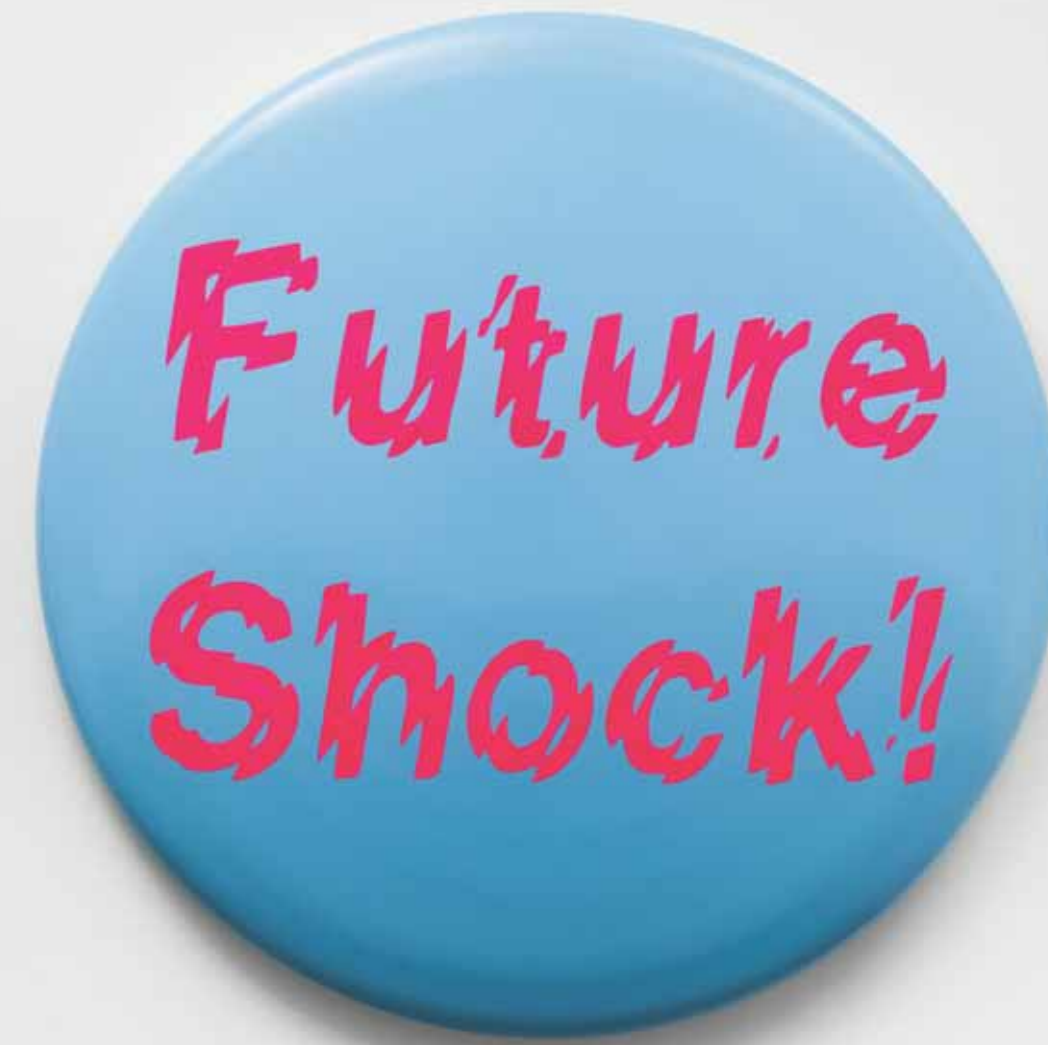
Future Shock 2020 Synthetic polymer on aluminium Diameter 110 cm, depth 10 cm

Rooting around in junk shops, I sometimes come across an old badge, a memory jog from a previous political or cultural moment. Badges have such a disproportionate weight of nostalgia compared to their rusty little size.