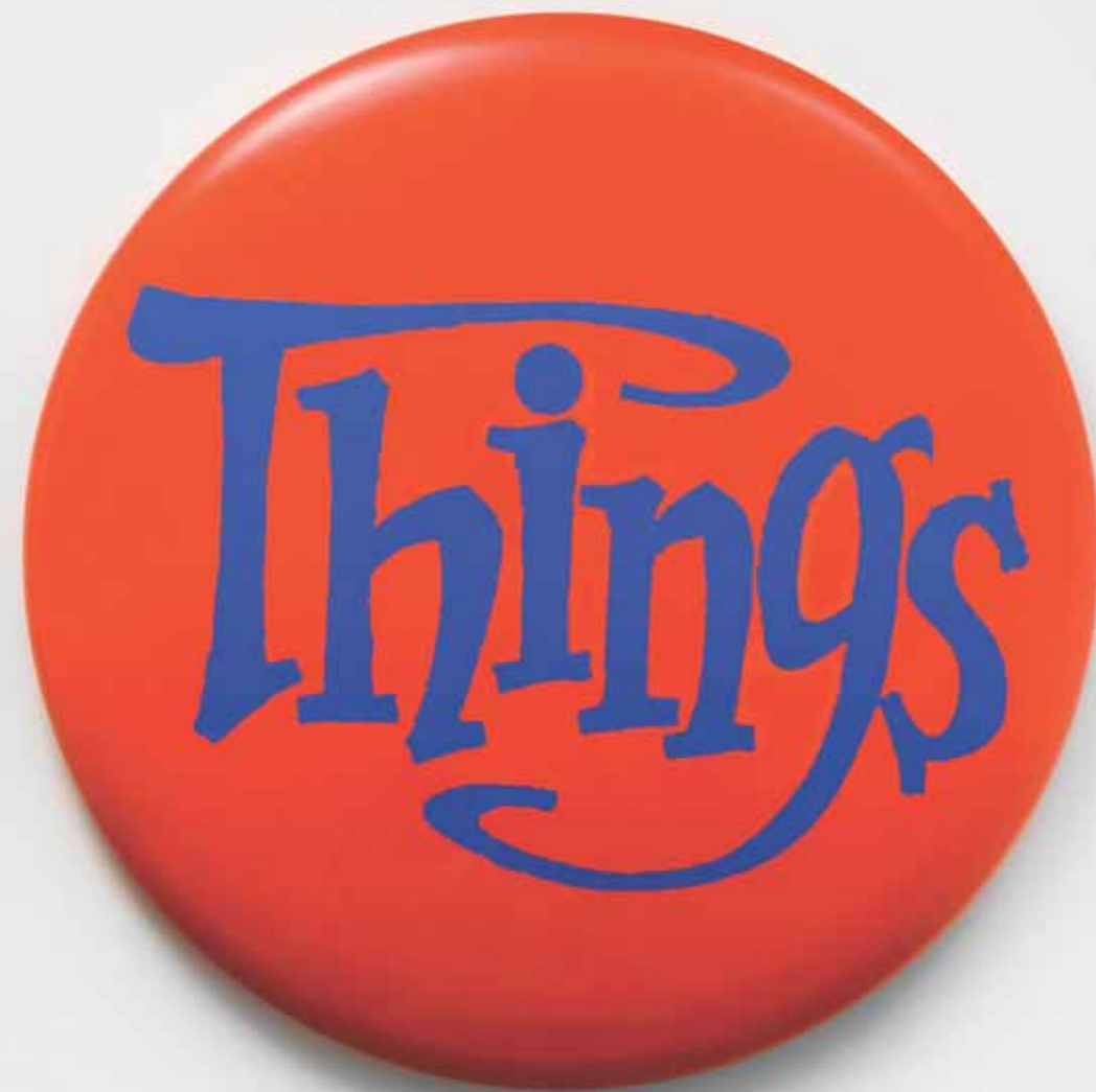
Things 2020 Synthetic polymer on aluminium Diameter 110 cm, depth 10 cm

I always have a favourite badge attached to a well-liked jacket. Currently my jackets sport the badges 'Mars or Bust', 'New Mexico', 'End Coal' and the boyishly entertaining 'Arizona Sheriff'. The right badge on the right jacket still seems to me to be cool. A mini snapshot of my intellectual and aesthetic progress at any one time.