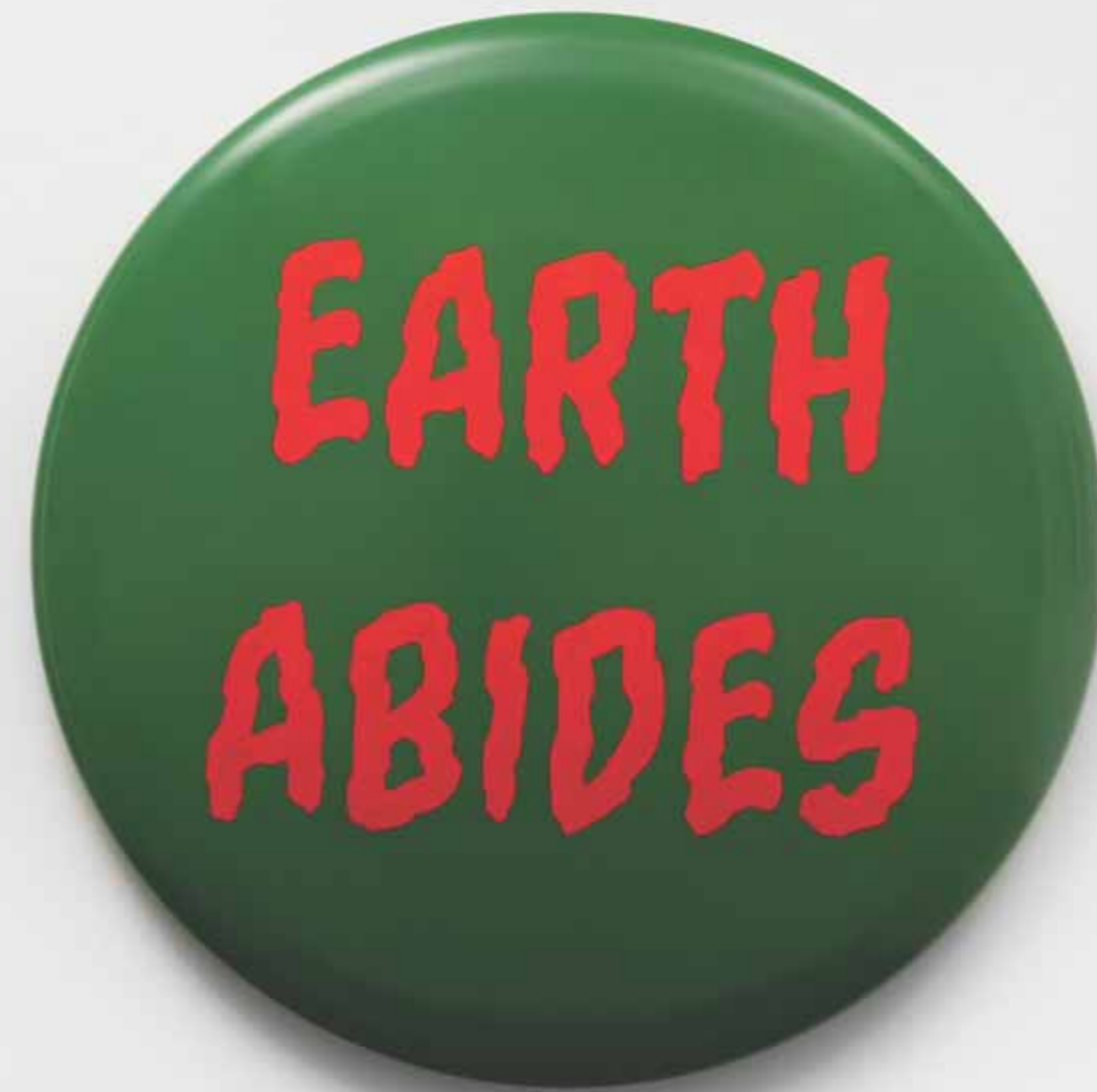
Earth Abides 2020 Synthetic polymer on aluminium Diameter 110 cm, depth 10 cm

B-movie film posters are an accumulation of discoveries that speak so clearly about the films they present. Punk found a graphic language cut directly out of newspaper headings. Old souvenir postcards reveal their country of origin, such as the brash fonts of the American West, prim English Tea Shop cute, and severe Eastern Bloc brutalism.