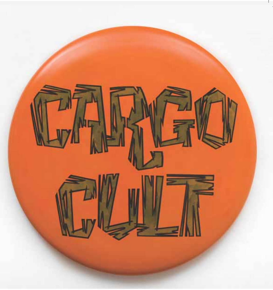
Soylent Green 2020 Synthetic polymer on aluminium Diameter 110 cm, depth 10 cm

With Giant Badges I have tried to recreate that powerful ache of memory. These works reference apocalyptic Sci-Fi films and futurist ideas, often from the 1970s. However, their giant size gives them a tactile contemporary 3D-ness that sends their message forward to the present. New Pop for a new age.