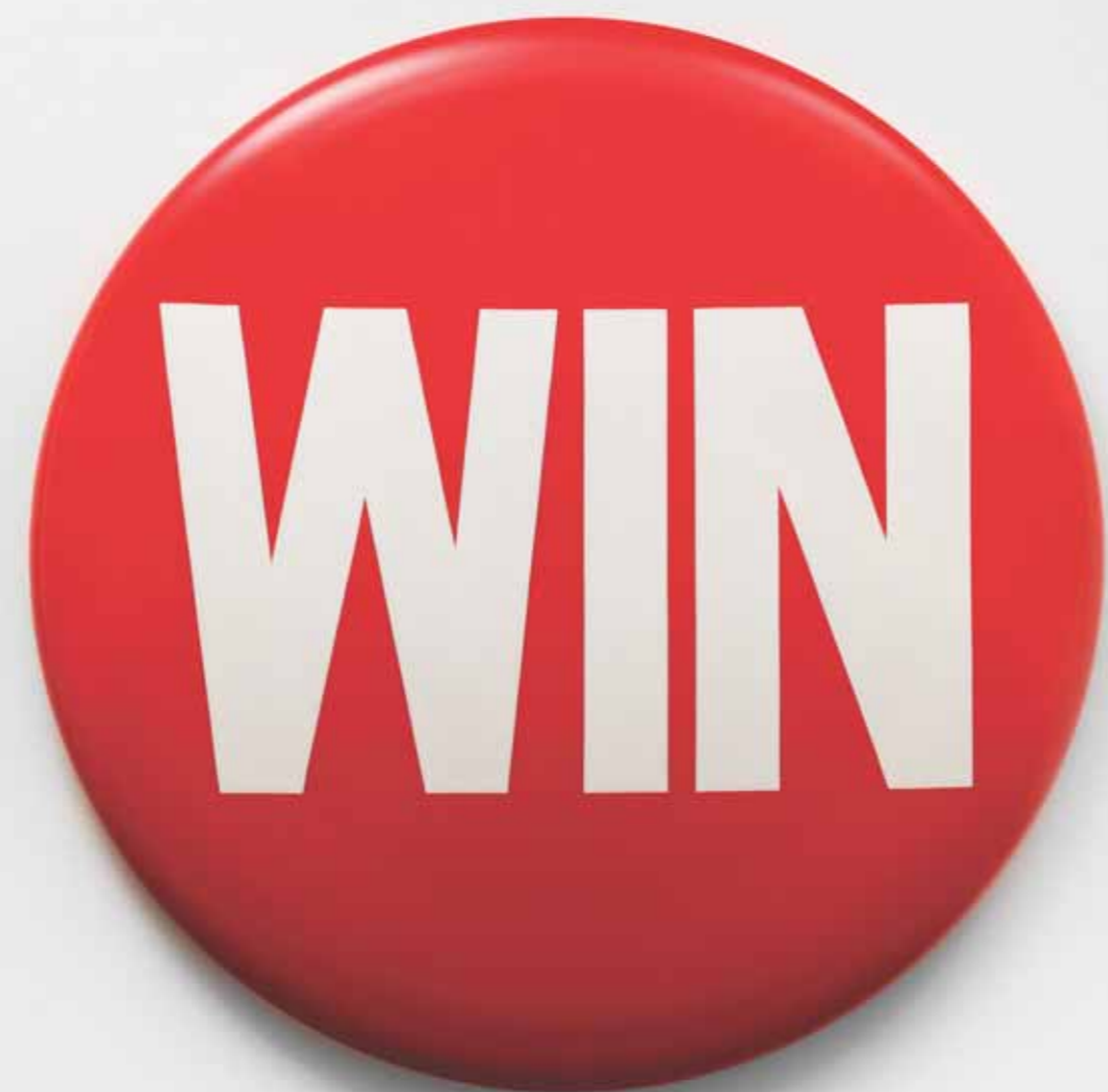
WIN 2020 Synthetic polymer on aluminium Diameter 110 cm, depth 10 cm

Did you ever wear a badge? Was it a favourite band, or a risky political slogan, or maybe a school prefect's badge? Badges run from the seriously authoritative, like the policeman's shield, to the antithesis, like 'Free Nelson Mandela'. The badge, in just a small space, imbues the wearer with an inordinate amount of meaning.